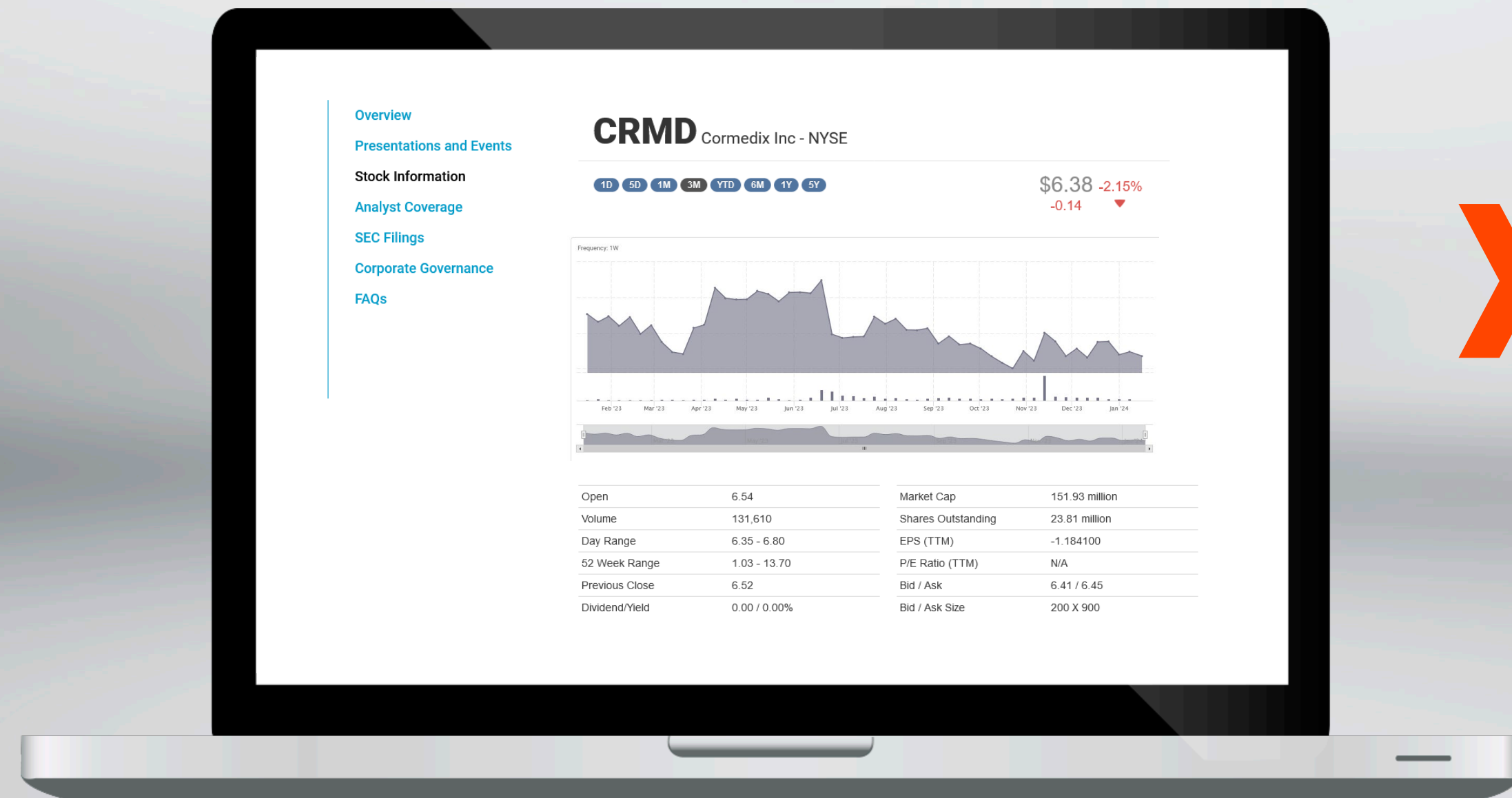
REDESIGN OF THE STOCK INFORMATION MODULE (API-BASED)